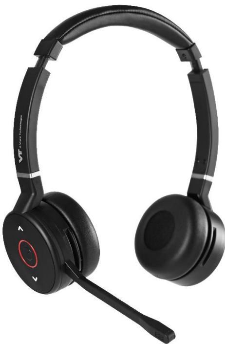
VT9800 BT Duo