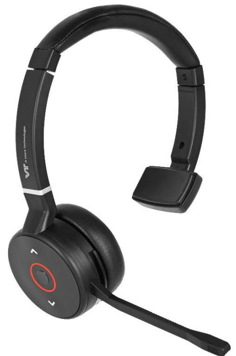
VT9800 BT Mono